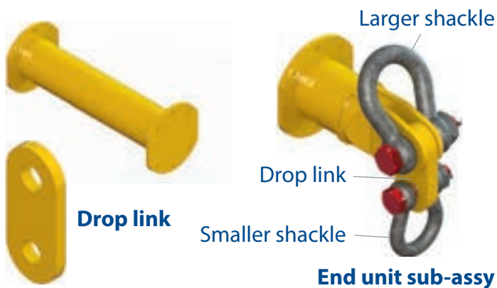
Table 1 – Component List