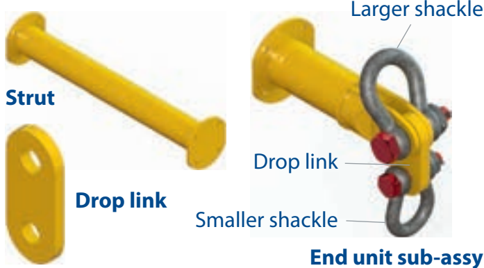
Table 1 – Component List