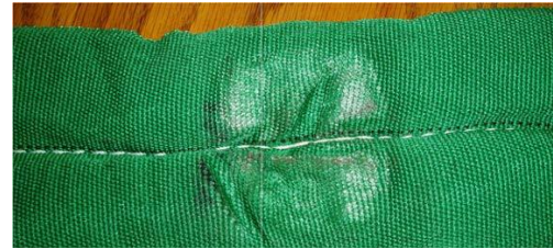
Figure 3- Loading Point After 50,000 Cycles

Testing was performed on a MTS 225 ton horizontal tensile test machine. During the cycling, temperature was measured by inserting a thermometer into the center crease of the sling as close to the loading surface as possible. After 50,000 cycles the slings were inspected for damage. Each showed some hardening and wear at the contact point as shown in Figure 3, but all remained intact.