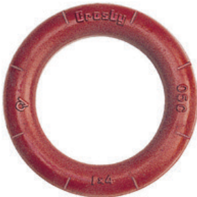
S-643 Weldless Rings