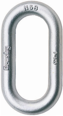
G-340 / S-340 Weldless End Link