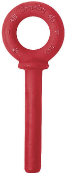
S-276 Shoulder Rivet Eye Bolt