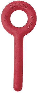
S-293 Rivet Eye Bolt