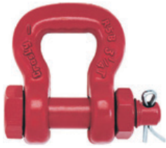
S-252 BOLT TYPE SLING SHACKLE