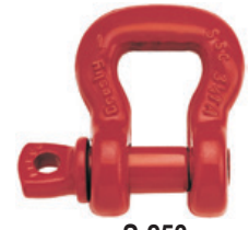
S-253 SCREW PIN SLING SHACKLE