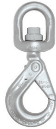
S-13326 SWIVEL HOOK with BEARING