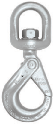
S-1326 SWIVEL HOOK