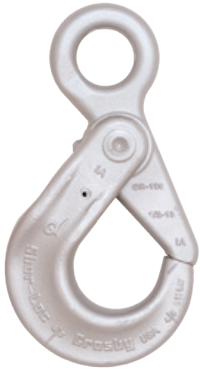
S-1316 EYE HOOK