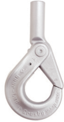
S-1318A SHANK HOOK