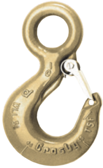
L-320AN EYE HOOK