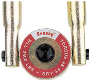
HR-125 Swivel Hoist Ring