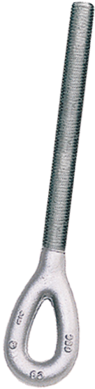
HG -4037 Eye End Fitting