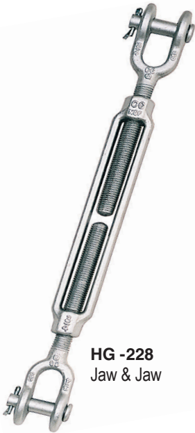
HG-228 Jaw & Jaw

Meets the performance requirements of Federal Specifications FF-791b, Type 1 Form 1 - CLASS 7, and ASTM F-1145, except for those provisions required of the contractor. For additional information, see page 452.