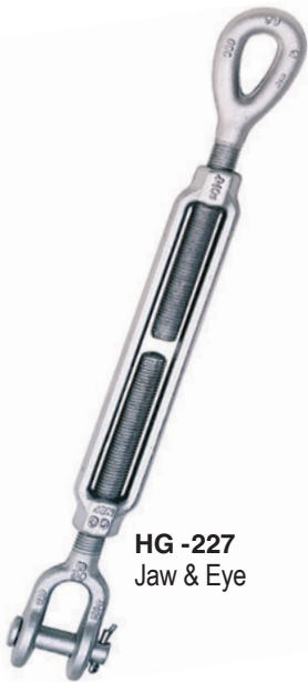
HG-227 Jaw & Eye