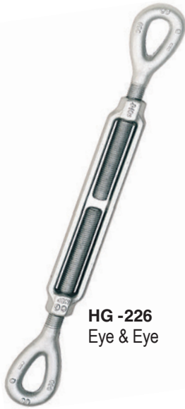
HG -226 Eye & Eye

Meets the performance requirements of Federal Specifications FF-791b, Type 1 Form 1 - CLASS 4, and ASTM F-1145, except for those provisions required of the contractor. For additional information, see page 452.