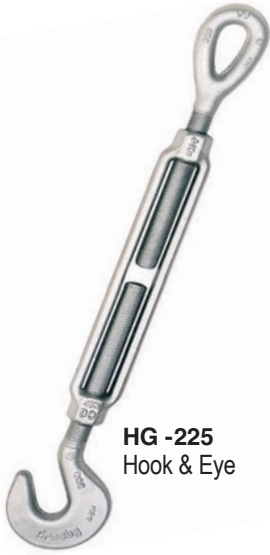
HG -225 Hook & Eye

Meets the performance requirements of Federal Specifications FF-791b, Type 1 Form 1 - CLASS 6, and ASTM F-1145, except for those provisions required of the contractor. For additional information, see page 452.