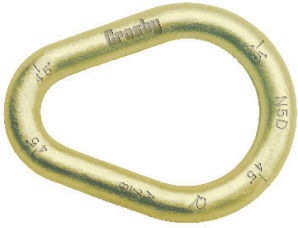
A-341 Alloy Pear Shaped Links