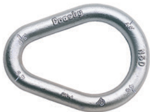
G-341 / S-341 Weldless Sling Link