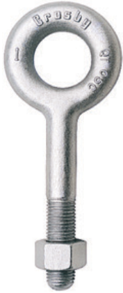
G-291 Regular Nut Eye Bolt