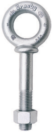
G-277 Shoulder Nut Eye Bolts