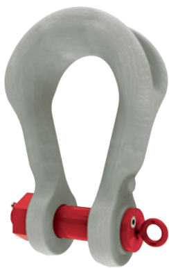
G-2160 / S-2160