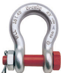
G-2140 / S-2140

G-2140 meets the performance requirements of Federal Specification RR-C-271G, Type IVA, Grade B, Class 3, except for those provisions required of the contractor. For additional information, see page 452.