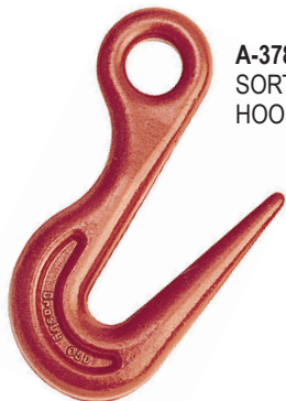
A-378 SORTING HOOK

*Ultimate Load is 5 times the Working Load Limit.