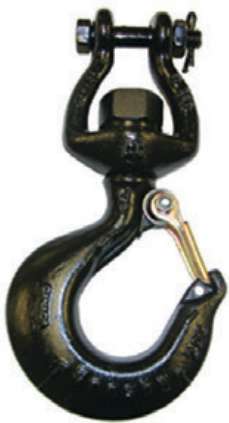
S-3316 REPLACEMENT HOOK

*Ultimate Load is 4 times the Working Load Limit.