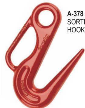
A-378 SORTING HOOK