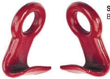
S-377 BARREL HOOKS