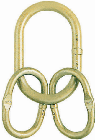
A-347 Welded Master Links

Ultimate Load is 5 times the Working Load Limit. Applications with wire rope and synthetic sling generally require a design factor of 5. Based on single leg sling (in-line load), or resultant load on multiple legs with an included angle less than or equal to 120 degrees. ** Proof Test Load equals or exceeds the requirement of ASTM A952(8.1) and ASME B30.9. For use with chain slings, refer to page 240 for sling ratings and page 245 for proper master link selection.