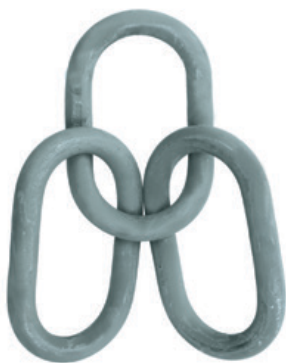
A-345CT Master Links Assembly