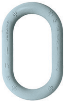
A-342CT Master Links