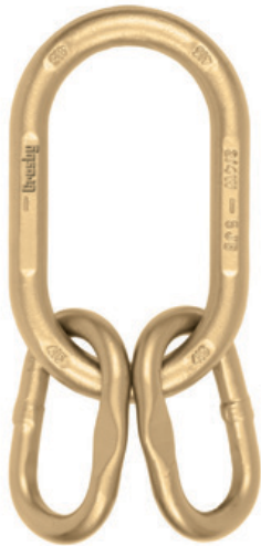
A-345 Alloy Master Links