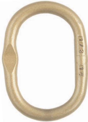
A-344 Welded Master Links

Ultimate Load is 5 times the Working Load Limit. Applications with wire rope and synthetic sling generally require a design factor of 5. Based on single leg sling (in-line load), or resultant load on multiple legs with an included angle less than or equal to 120 degrees. ** Proof Test Load equals or exceeds the requirement of ASTM A952(8.1) and ASME B30.9. For use with chain slings, refer to page 240 for sling ratings and page 245 for proper master link selection.