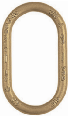
A-342 Alloy Master Links