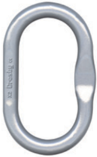
A-1342N Master Link