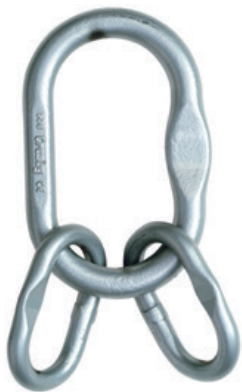
A-1345N Master Link Assembly

* Minimum Ultimate Load is 4 times the Working Load Limit. ** Welded.