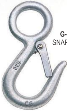
G-3315 SNAP HOOK