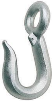
1210 Round REVERSE EYE HOOK

*Ultimate Load is 4 times the Working Load Limit.