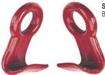
S-377 BARREL HOOKS

*Ultimate Load is 4 times the Working Load Limit.