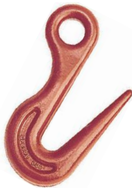
A-378 SORTING HOOK

*Ultimate Load is 5 times the Working Load Limit.