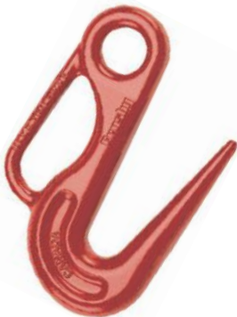
A-378 SORTING HOOK