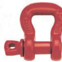
S-253 SCREW PIN SLING SHACKLE