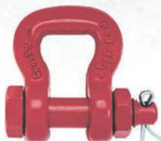
S-252 BOLT TYPE SLING SHACKLE