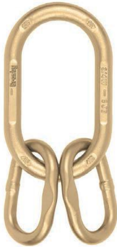
A-345 Alloy Master Links