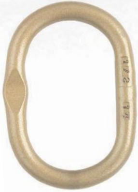
A-344 Welded Master Links

Ultimate Load is 5 times the Working Load Limit. Applications with wire rope and synthetic sling generally require a design factor of 5. Based on single leg sling (in-line load), or resultant load on multiple legs with an included angle less than or equal to 120 degrees. ** Proof Test Load equals or exceeds the requirement of ASTM A952(8.1) and ASME B30.9. For use with chain slings, refer to page 240 for sling ratings and page 245 for proper master link selection.