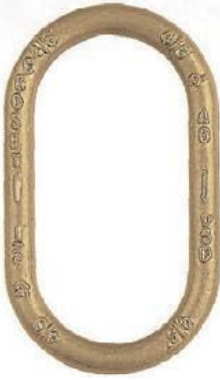
A-342 Alloy Master Links