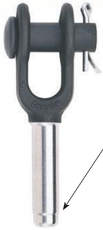
S-501 Open Swage Sockets