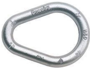
G-341 / S-341 Weldless Sling Link

*Based on single leg sling (in-line load), or resultant load on multiple legs with an included angle less than or equal to 120°. Minimum Ultimate load is 5 times the Working Load Limit. †† Welded Link.