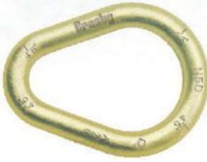
A-341 Alloy Pear Shaped Links